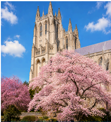
THE NATIONAL CATHEDRAL

Celebrate the season with an elegant lunch and a glass of pink rosé.