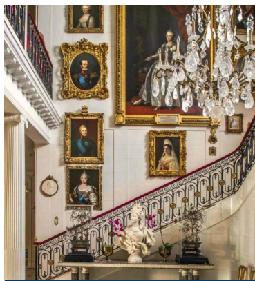
HILLWOOD ESTATE & GARDENS