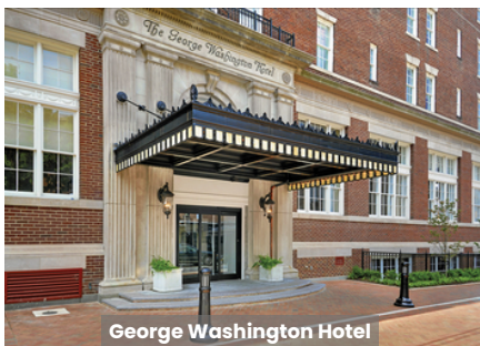
George Washington Hotel