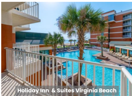
Holiday Inn & Suites Virginia Beach