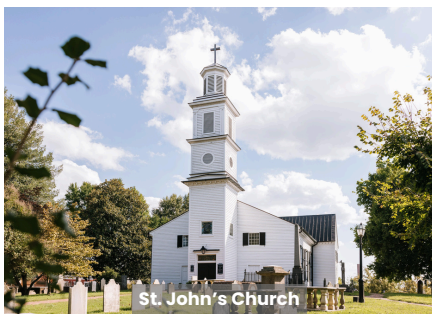
St. John's Church