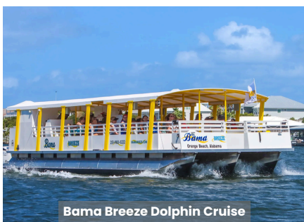
Bama Breeze Dolphin Cruise