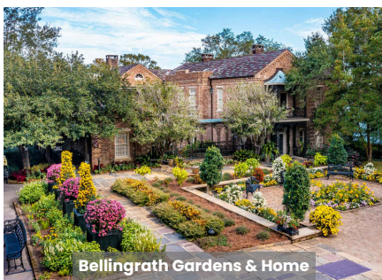
Bellingrath Gardens & Home