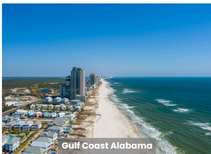
Gulf Coast Alabama