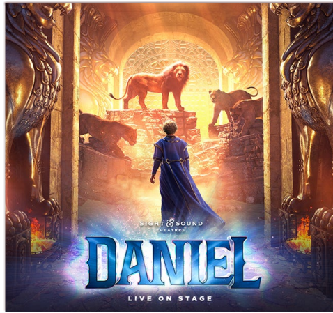
SIGHT & SOUND THEATRE