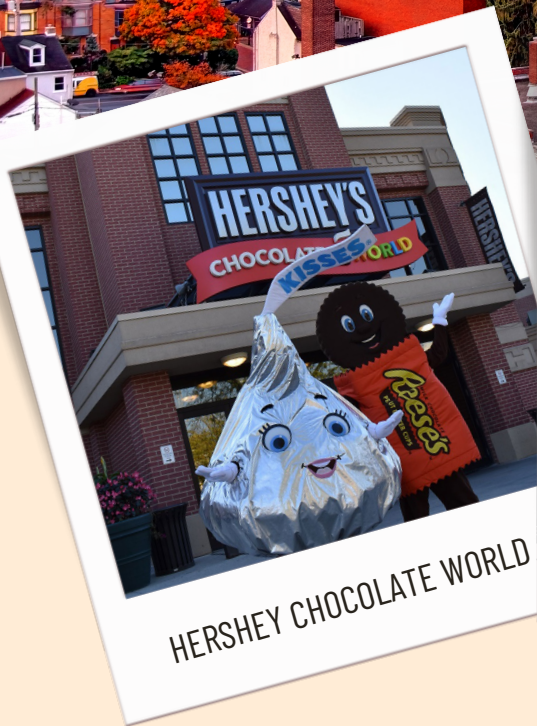
HERSHEY CHOCOLATE WORLD