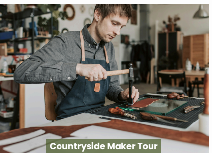
Countryside Maker Tour