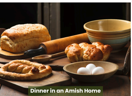
Dinner in an Amish Home