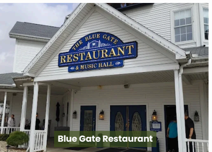
Blue Gate Restaurant