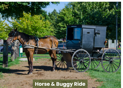
Horse & Buggy Ride