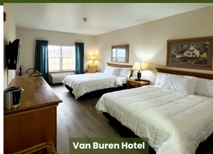
Van Buren Hotel