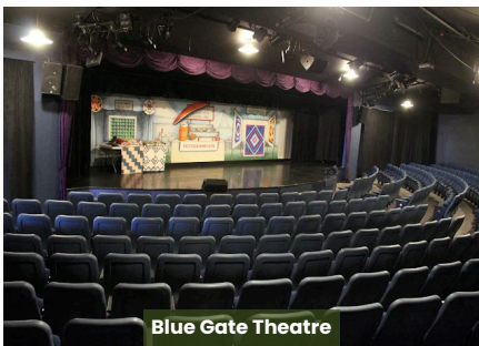
Blue Gate Theatre