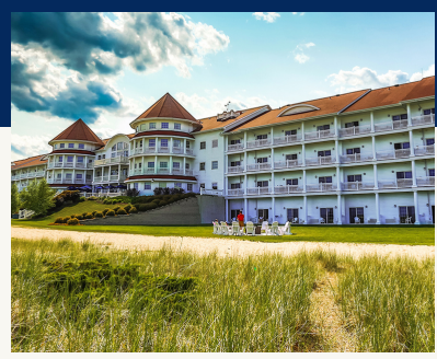
Blue Harbor Resort