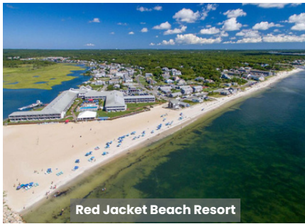
Red Jacket Beach Resort