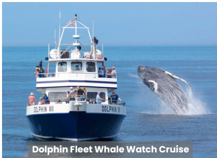
Dolphin Fleet Whale Watch Cruise