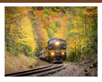
Day 5: Potomac Eagle Train Ride:

Embark on a nostalgic journey aboard the Potomac Eagle train, relishing a 4-course luncheon along the way. Journey into the heart of Appalachia and immerse yourself in the charm and nostalgia of a heritage train ride. Come for a country railroad adventure and let the canyon eagles inspire you and enhance your connection with nature. From the gorgeous views of the Trough to the immersive river scenery found along the historic South Branch, Potomac Eagle offers a glorious autumn train ride that is unlike any other. As you wind along the South Branch of the Potomac River, you'll enter a visually-striking gorge known as the Trough, a wild canyon full of American bald eagles Travel to our hotel in Buckhannon SureStay Plus By Best Western for a restful evening. (B, L)