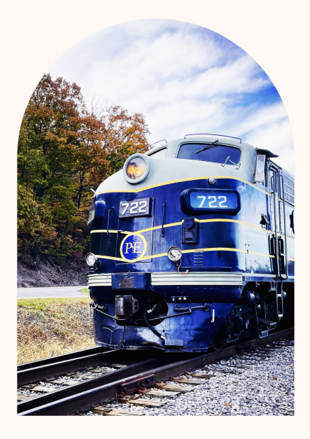
2 SCENIC TRAIN RIDES