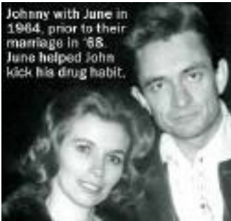
Johnny with June in 1964, prior to their marriage in '68. June helped John kick his drug habit.

From the heart of the songs of Johnny Cash comes a unique musical show about love and faith, struggle and success, rowdiness and redemption, home and family. These are songs full of love and feelings, wit and understanding, and like all