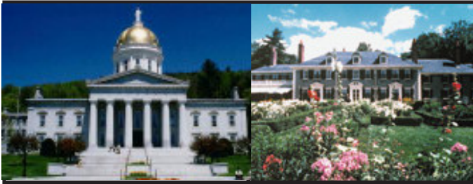
Vermont State House

$1849 private room $1289 per person, triple $1249 per person, quad